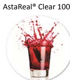
AstaReal® Clear 100